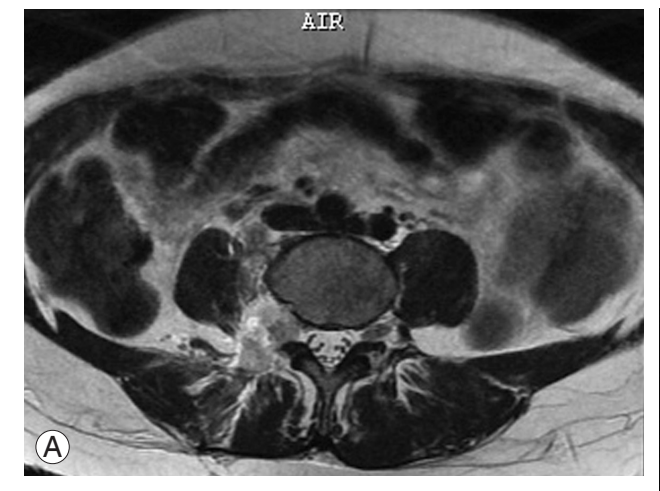
Fig. 2. Postoperative, contrast-enhanced axial (A) and sagittal (B) magnetic resonance imaging images showing complete excision.